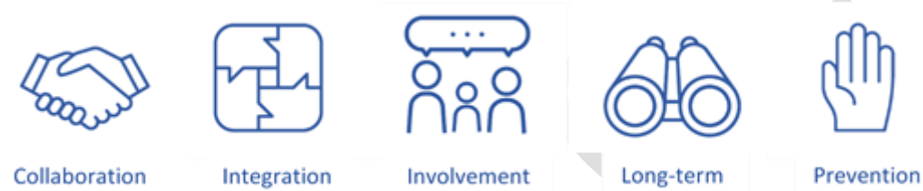
Figure 1: The 5 ways of working from the Well-being of Future Generations Act

Just as when we were preparing the Well-being Assessment, we have used the five ways of working, collaboration, integration, involvement, long-term, and prevention, to guide our work. This means that while considering how to improve well-being in our communities now, we've also looked at how well-being could be affected in the future and how we can prevent issues becoming worse. We will need to work together to see what we're each doing in a community and how this affects what we do, individually and in partnership. Finally, but most importantly, we want our communities, professionals, businesses, and others to identify the issues which are most important to them. As we develop how we will be delivering the Objectives and Steps (regional and local delivery plans) we will continue to use these principles to guide our work.